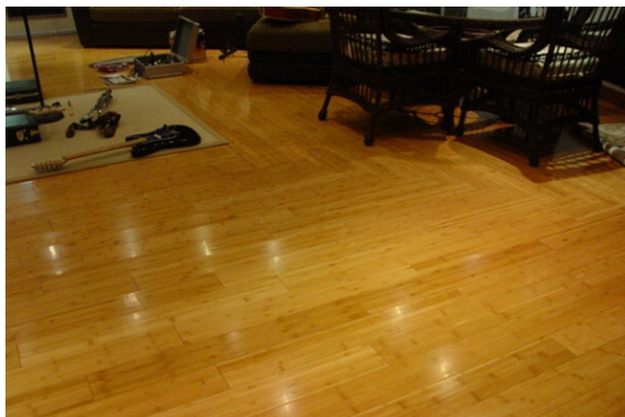
Solid bamboo: Natural / Horizontal

Solid bamboo flooring is recommended for all domestic and light commercial use. It is hard-wearing, but, like most timber floors, will dent if something heavy is dropped or dragged on it, or if walked on in stiletto heels.