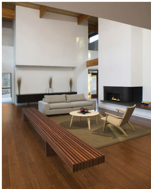
Strand-woven bamboo: Caramel