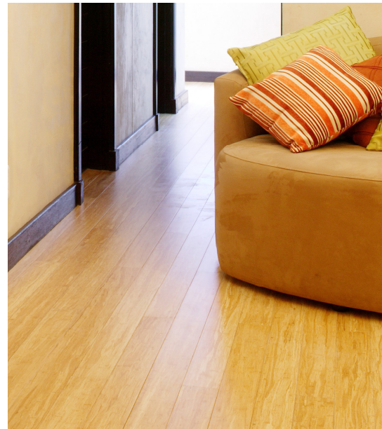
Strand-woven bamboo: Natural

Strand-woven bamboo flooring is recommended for both domestic and commercial applications.